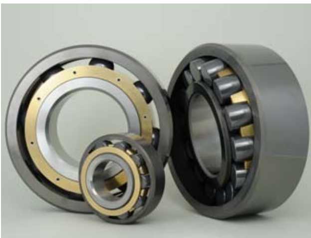
CEROBEAR Hybrid Ball & Roller Bearings for High Pressure Autoclaves

The maintenance interval of high pressure autoclaves is very often defined by the service life of the motor and stirrer bearings. Although these bearings seem to be well dimensioned with regard to the relatively low weight of the motor or the stirrer they carry, the bearings normally fail after some weeks or latest some months, only. These early bearing failures are related to the poor lubrication conditions under which the bearings have to operate. Due to the high product flow through the reactor, conventional lubrication by oil and grease is not possible, because the lubricant is simply washed away by the product. The only "lubricant" which remains for the bearings, is the product itself. But the low viscosity of the media, gaseous ethylene or EVA at the motor and upper stirrer bearings and a mix of gaseous and liquefied ethylene or EVA in the lower stirrer bearing position, does not allow to build a separating film between the rolling elements and the races. As a consequence adhesive wear on the steel rolling partners leads to rapid surface degradation and subsequent bearing failure, often caused by a catastrophic cage collapse.