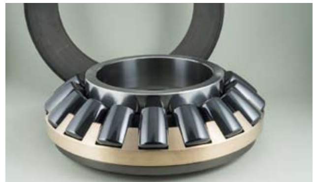
Unique CEROBEAR Thrust Spherical Roller Bearing

As a consequence \text{Si}_3\text{N}_4 is inert, it does not react with other materials and there is no material transition, no adhesive wear, between the rolling partners. At the same time \text{Si}_3\text{N}_4 provides more than twice the hardness than bearing steel, which means that in hybrid bearings also the abrasive wear rate is significantly lower than with steel bearings. As a result the service life of hybrid bearings is between 4 to 8 times longer than the one of conventional steel bearings. Reduced reactor downtime and maintenance cost and minimized production loss over compensate the higher cost for the ceramic technology.